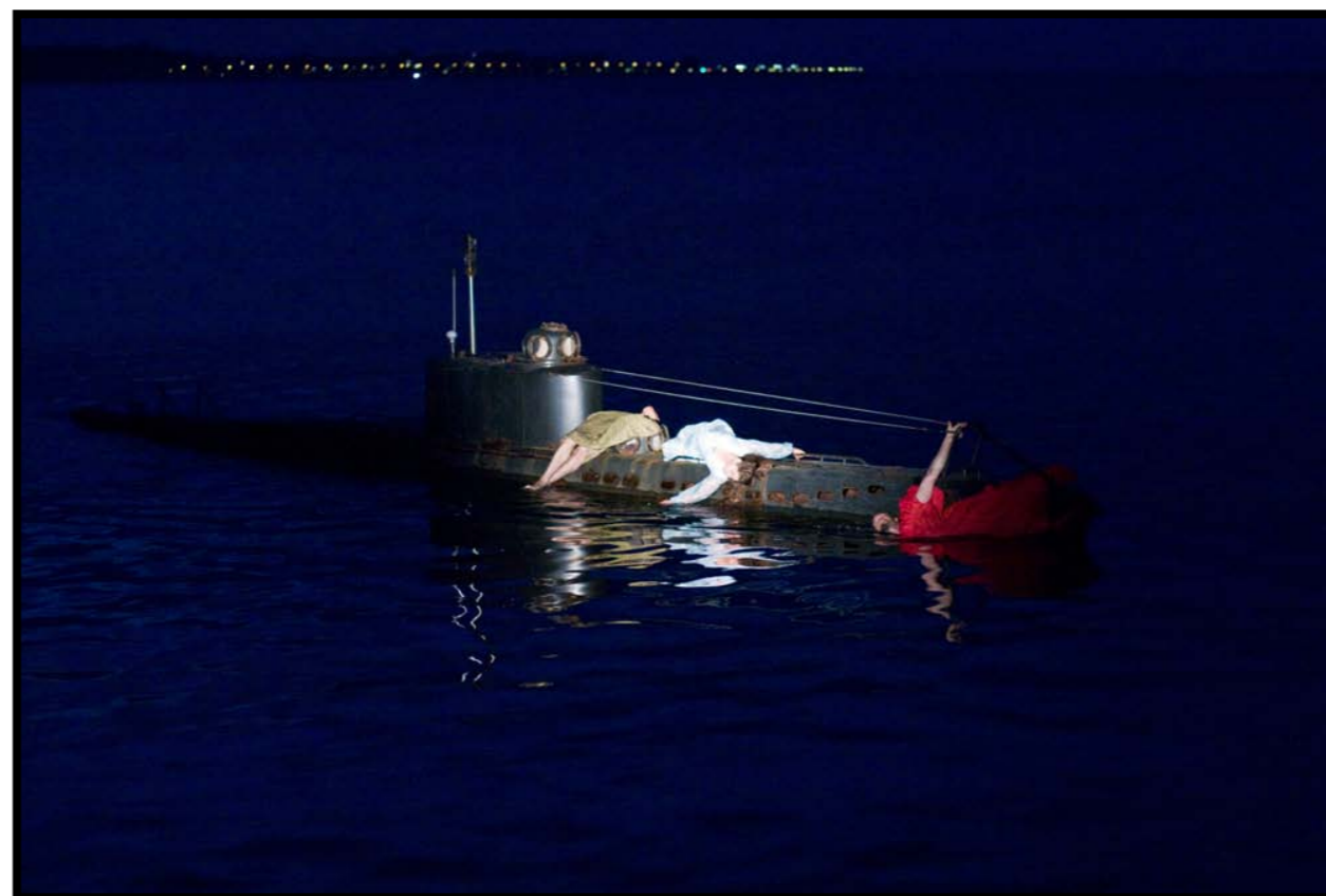
AQUARIUM and KRAKA (below)